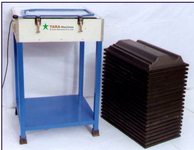
TARA Micron with tile moulds